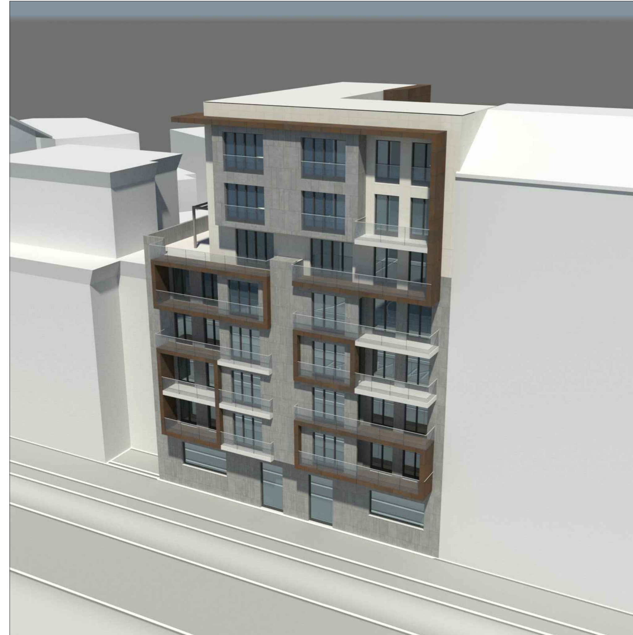
VISTA CORSO FRANCIA