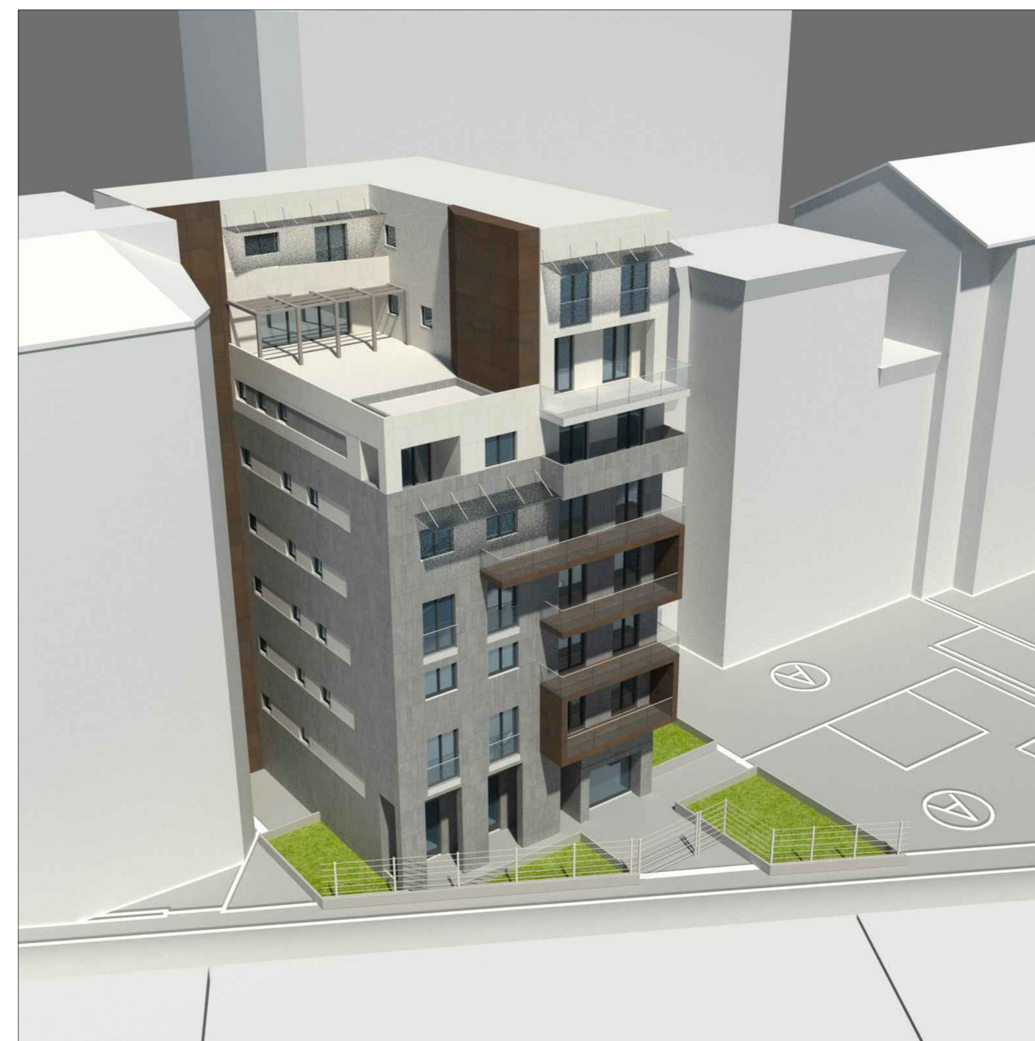
VISTA VIA DUCHESSA JOLANDA