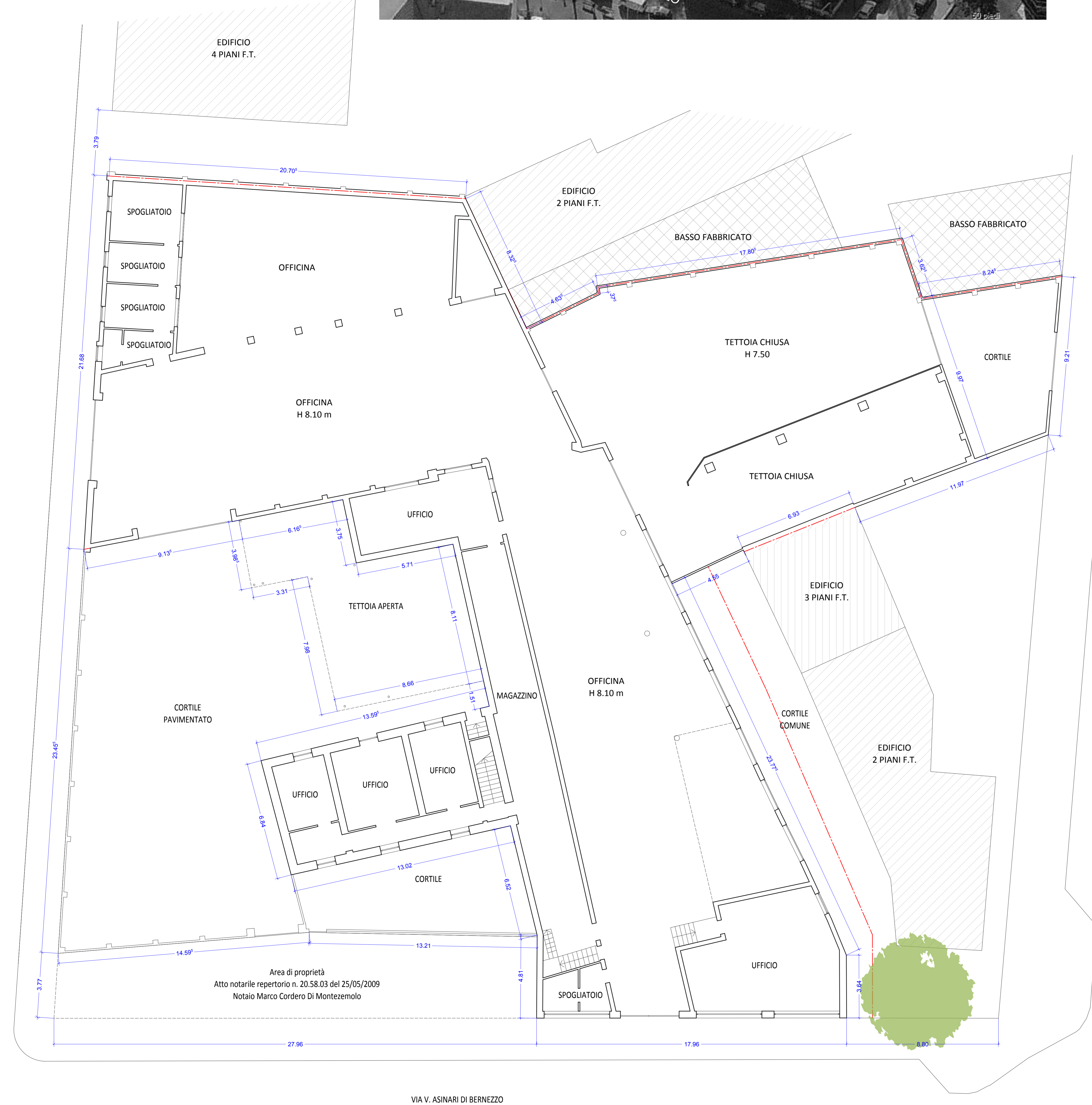
PIANTA PIANO TERRA 1:200